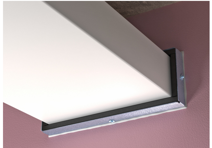
QRS Fire Sleeve installed in plasterboard partition