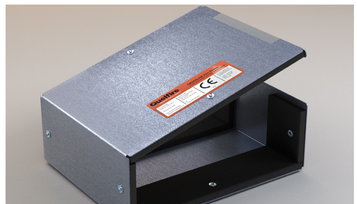
QRS CE Marked Intumescent Fire Sleeve - rectangular (open)

WARRANTY The Company warrants its products to be free from defects in material and workmanship for a period of 12 months from the date of delivery. The Company's obligation under this warranty is limited, as its option, to the repair or replacement, free of charge, or refund of the net Invoiced price of any part found to be defective, and which, in the Company's opinion, has not been subject to undue wear and tear, accident, alteration, abuse or misuse. Consequent damages are expressly disclaimed. Technical advice from Quelfire whether verbal, in writing or by way of trials, is given in good faith but without warranty. The application, use and installation of the Company's products are beyond the control of the Company, and the purchaser is solely responsible that goods are fit for any particular purpose. In line with the Company's policy of continual research and development, product specifications and availability are subject to change or withdrawal without prior notice.