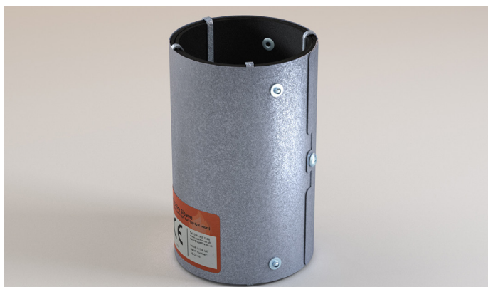
QRS CE Marked Intumescent Fire Sleeve - circular

*QRS130 and QRS110 are not currently CE Marked