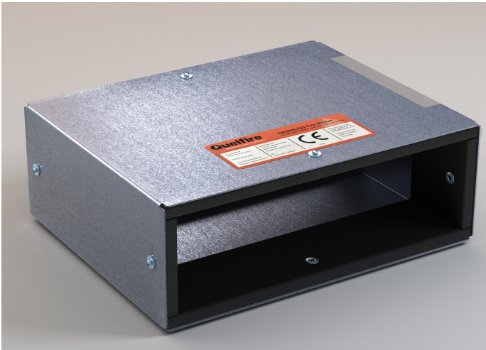
QRS CE Marked Intumescent Fire Sleeve - rectangular

Quelfire QRS CE Marked Intumescent Fire Sleeves prevent the spread of fire where plastic pipes or plastic ducts penetrate fire compartment walls.